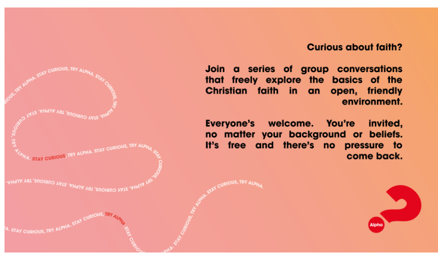
ALPHA Course starting 10th January 2024 at St. Paul's