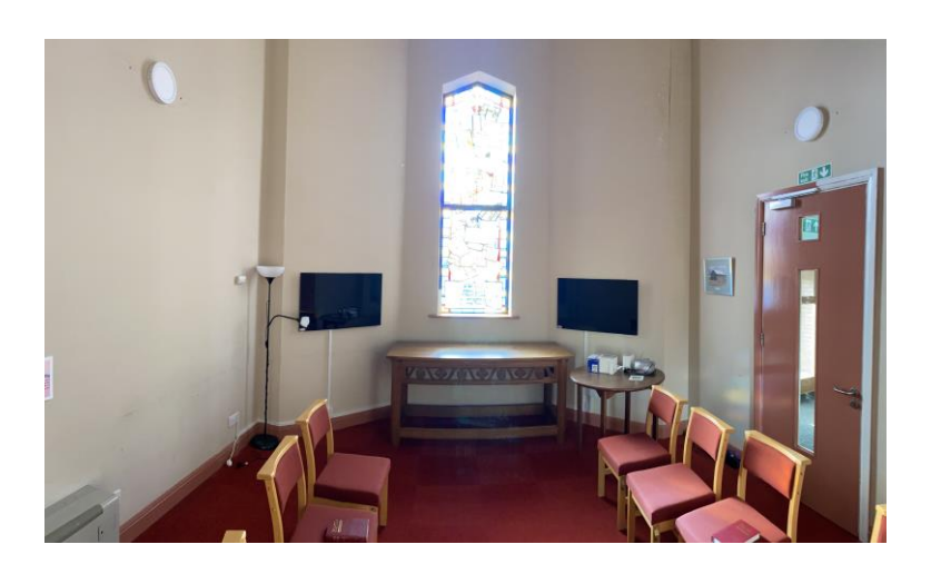
CONNECT Group on Wednesday evenings 6 to 7pm at St. Paul's.

Join us for Bible study, Prayers and Companionship. We share hot soup and bread rolls.